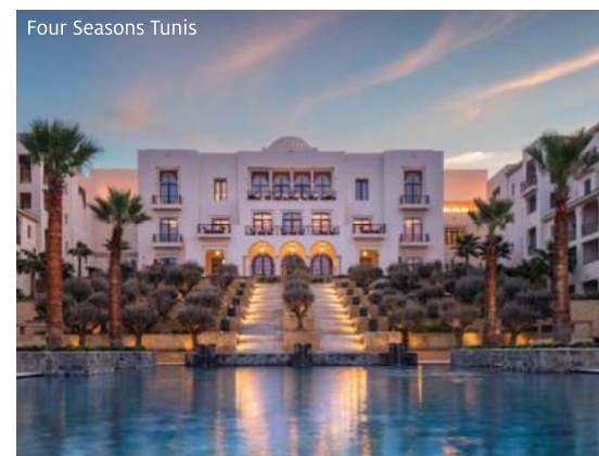
Four Seasons Tunis

For more information, please visit: www.theclementpaloalto.com www.ventanabigsur.com www.fourseasons.com/tunis