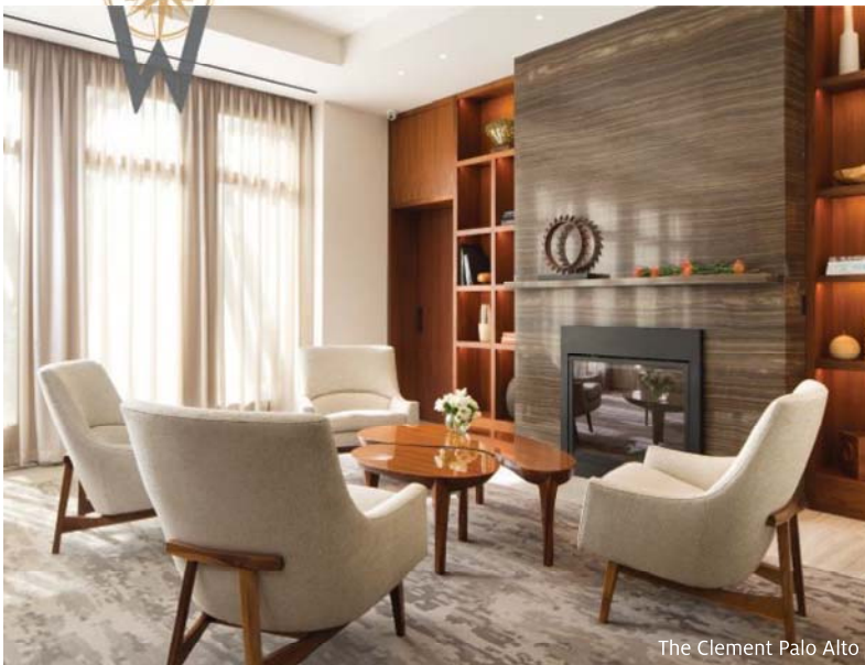
The Clement Palo Alto